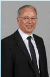
Tony ESTANGUET, Executive Board President